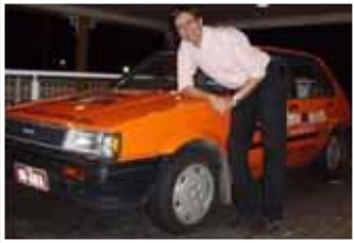
Greg Combet on the Campaign Trail

The display will celebrate one of the most successful union campaigns in modern Australian history.