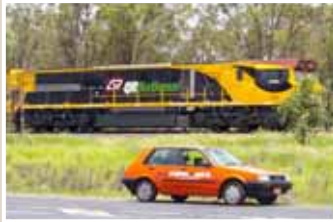
On the road again - heading to the Workers Heritage Centre