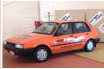
Finally home on display at the Workers Heritage Centre - Barcaldine

The Workers Heritage Centre does not receive any operational funding support from any level of Government - Local, State or Federal.